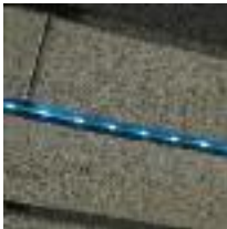
RGB (Red, Green, Blue)