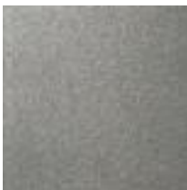
Kera Linea Pearl Grey