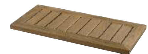
Small Shelf 60cm