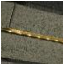
RGB Continuous Strip